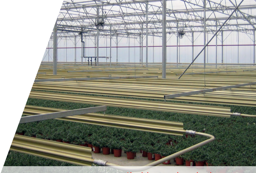
Aluminium greenhouse heating system

to your customer's specific requirements and manufactured by us in-house. These aluminium benches can also be delivered in parts. There are some restrictions to assembling these benches on site, however, due to the welding smoke, the required process controls and the expertise needed for welding these benches. For the export we therefore also offer a fully patented screwed mobile bench design. One that due to the smart screw connections and accompanying installation template can easily be assembled locally without specific knowledge.